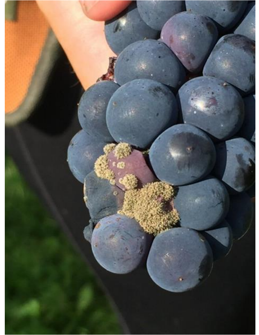
Too much gray mold “fuzz”