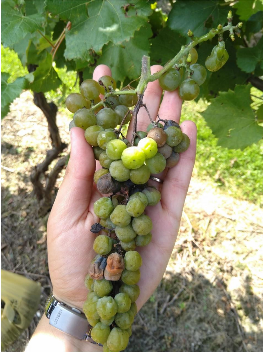
Too many wrinkled berries